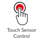
Touch Sensor Control